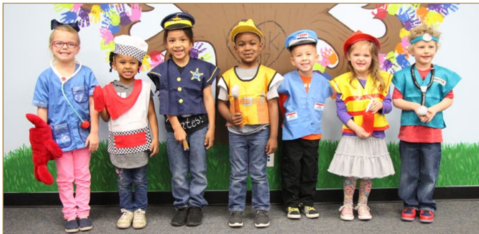
Students at D.D. Kirkland Elementary dress up for Career Day.

Please take a moment to WATCH THIS VIDEO and hear firsthand the dreams of Putnam City's littlest students, then